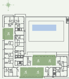
Key Plan of floors 5 & 12.